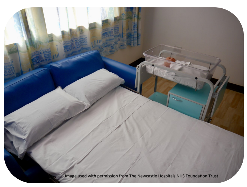
Figure 2. Standalone cot