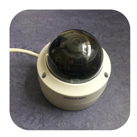
Figure 3. The camera that we use is a small CCTV camera which will be attached to the ceiling in Newcastle Birthing Centre.

Using video as a research tool means that we can understand how you and your baby are behaving without having to disrupt you in an important time. It also helps us to understand how you and your baby behave when you are sleeping. We record sound so that we can hear the noises that your baby makes, such a fussing, crying and suckling.