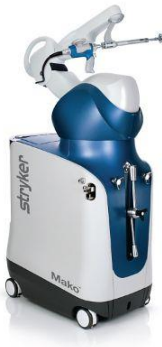
Figure 1: The MAKO robot. The surgeon moves it into the surgical field after exposure of diseased joint and the robot controls the preparation and insertion of the implants

MAKO is currently the robotic assisted hip replacement system used most frequently within the NHS (MAKO, Stryker, USA) – see figure 1. Whilst other robotic-arm systems are becoming available, their development has been hampered by Stryker holding many of the key patents. There are currently 850 MAKO robots worldwide; 25 used in the UK for hip and knee joint replacement surgery.