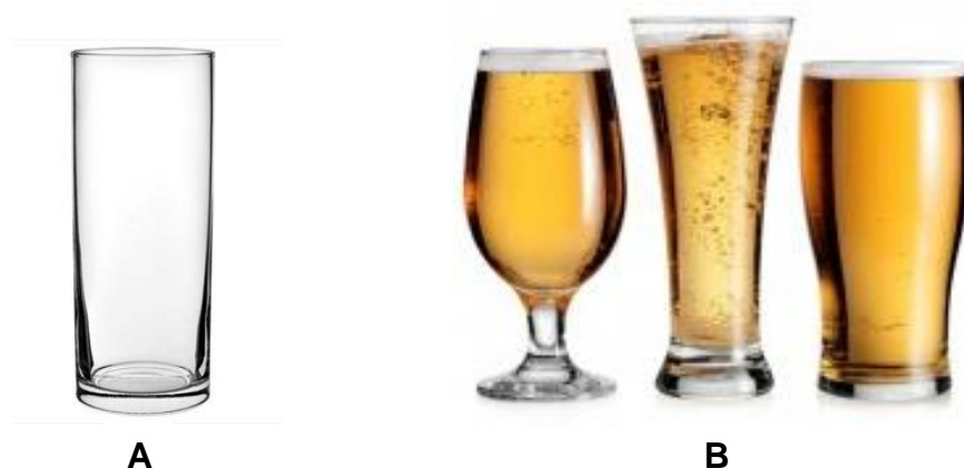
Figure 2. Straight-sided pint glass that will be provided by the research team (A) and examples of curved pint glasses (B).

Public houses and bars will serve lager, ale and cider in either their usual pint and half pint glasses or straight-sided glasses provided by the research team. The key difference between the two glass shapes is that the width of the straight-sided glass is consistent all the way up (Figure 2).