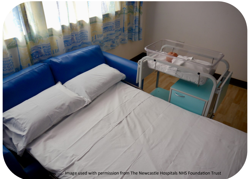
Figure 1. Portable cot