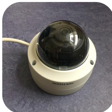
Figure 3. The camera that we use is a small CCTV camera which will be attached to the ceiling in Newcastle Birthing Centre.

Using video as a research tool means that we can understand how you and your baby are behaving without having to disrupt you in an important time. It also helps us to understand how you and your baby behave when you are sleeping. We record sound so that we can hear the noises that your baby makes, such as fussing, crying and suckling.