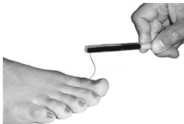
Figure 2, A monofilament test taking place.

The NHS normally uses a so-called monofilament to test for diabetic neuropathy. A monofilament is a thin, wire-like piece of plastic. It gets pressed against the skin but does not break the skin. The person doing the test will press the monofilament against your skin a few times, and ask you if you felt each press or not. Monofilament testing mainly tests for large nerve fibre function.