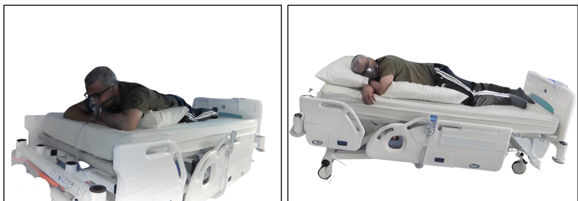
Figure 2: Images of full-prone and 3/4 prone position

We carefully considered the optimum daily target for awake prone positioning, noting that in observational studies a treatment duration of 6-8 hours/ day seems to be a key cut-off for treatment efficacy. 25 26 However, the recent systematic review and meta-analysis of